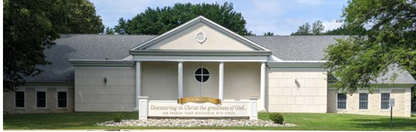
The Worship Center