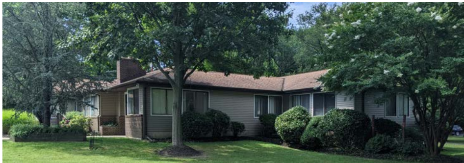
The Ministry Center

We understand that life is not always easy and so we have developed the role of a Woman's Advocate. A Woman's Advocate is a woman who is a church member with a godly reputation and has a sound grasp of biblical doctrine. She serves as a liaison between the Session and any female member in distress, and she is available to assist women as they plead their needs before the Session. We also have a group of members who have been trained in lay counseling (lciministry.org). These members counsel others under the guidance of a licensed counselor.